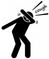
Cover your cough