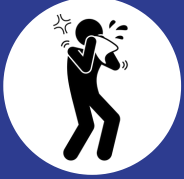
Coughing and Sneezing

COVID-19 is a respiratory illness that can spread from person to person just like a cold or the flu.