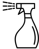
Clean high touch surfaces