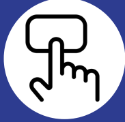
Touching surfaces with virus on it

The virus that causes COVID-19 is a novel coronavirus that was first identified during an investigation into an outbreak in Wuhan China.