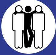
Close personal contact