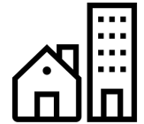
Stay home when sick