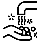
Wash your hands